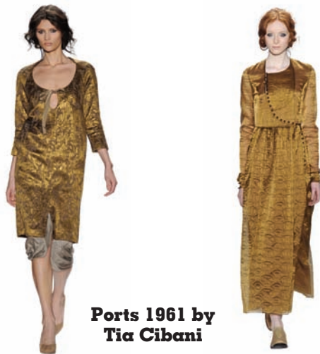
Ports 1961 by Tia Cibani

Like the olive in a martini, Warm Olive, a rich yellow-green, adds a touch of elegance and sophistication to fall. When combined, this tangy, intriguing hue makes all other colors come alive.