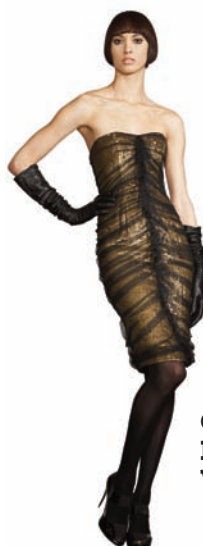
Carmen Marc Valvo