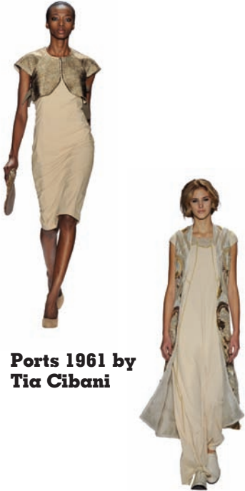
Ports 1961 by Tia Cibani

MOST IMPORTANT COLOR Amber — it's the symbol of courage