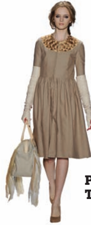
Ports 1961 by Tia Cibani

A range of Beiges serve as a foundation for pairings with rich and saturated brights