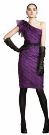
Carmen Marc Valvo