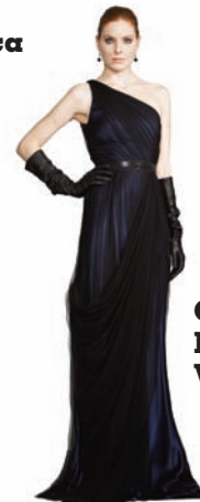
Carmen Marc Valvo