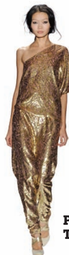
Ports 1961 by Tia Cibani